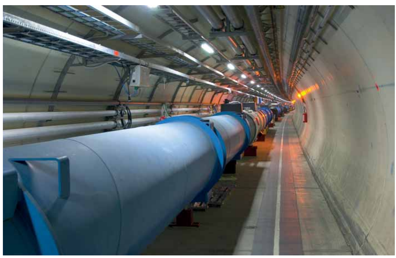
HLC CERN accelerator